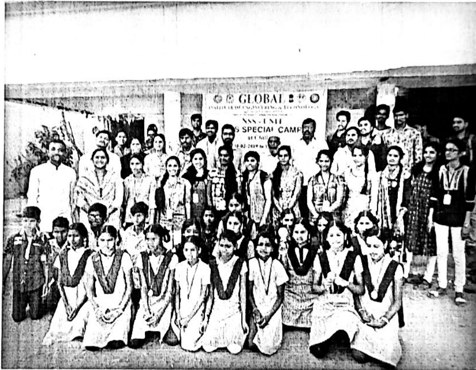
Students participated in special camp

Global Institute of Engineering and Technology – NSS cell has organized “Skill Development program” on 9 th February 2019 at Chilkur village. 66 NSS volunteers and 6 committee members have participated in the camp. Various competitions were conducted to the village people and school students during the camp.