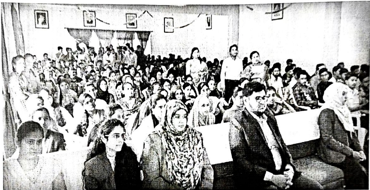
Students listening the words from speaker on Save Environment From Plastic