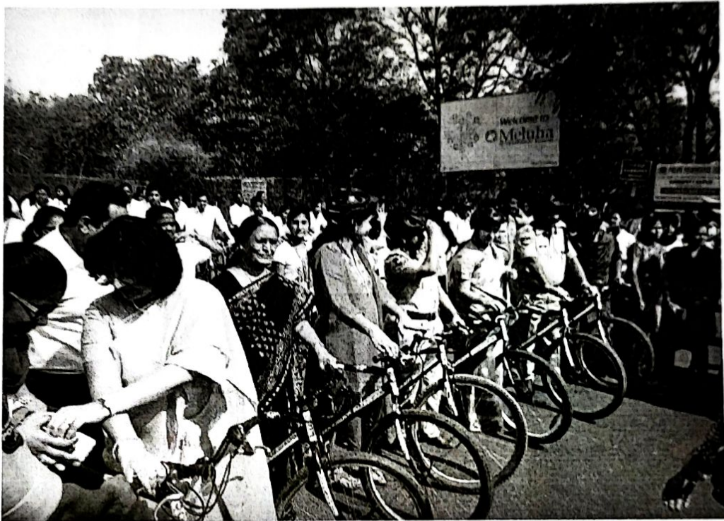
Students and NSS members participated in the Road Safety Awareness Program

Global Institute of Engineering and Technology – NSS cell has conducted the Road Safety awareness Program on 6 th December 2018. 90 NSS volunteers and 6 committee members along with other student participants were present and Police Sub Inspector ACP Ashok addressed the gathering and explained the safety precautions to have on roads in the driving and created the awareness on the road safety.