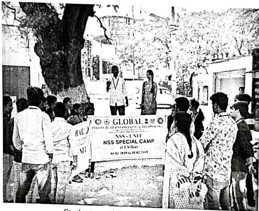
Students participated in special camp

Global Institute of Engineering and Technology – NSS cell has organized “Health and Hygiene precaution” on 6 th February 2019 at Chilkur village. 65 NSS volunteers and 6 committee members have participated in the camp. Free medical Check-up and Medicines Distributed to the village people during the camp.