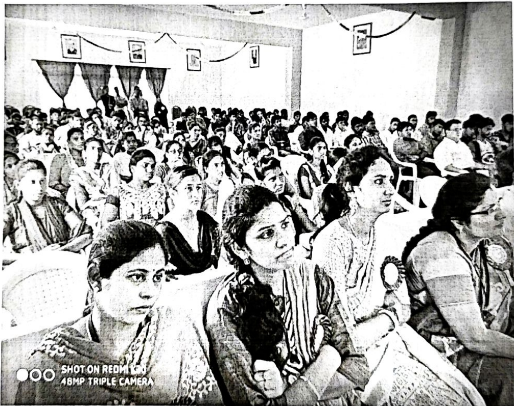
Students attended the Eye Donation Awareness Program