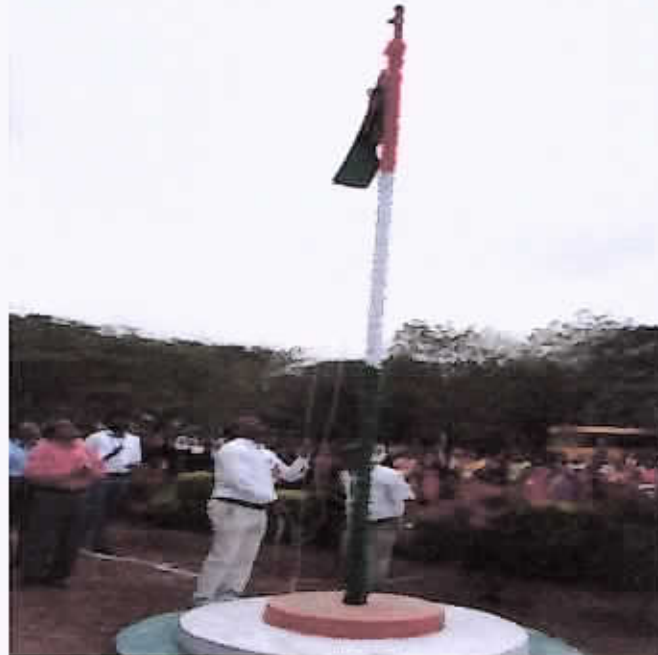
GIET NSS Cell celebrated Independence Day in GIET campus