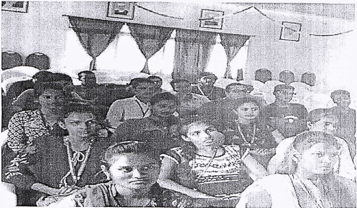
Research Methodologies (Module-I)

After lunch, Valedictory session was held which was followed by collecting feedback from the participants. Then the certificates were distributed to the participants.