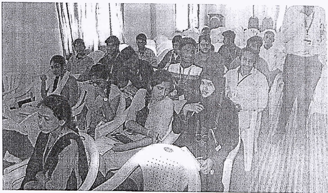
Research Methodologies (Module-II)

After lunch, Valedictory session was held which was followed by collecting feedback from the participants. Then the certificates were distributed to the participants.