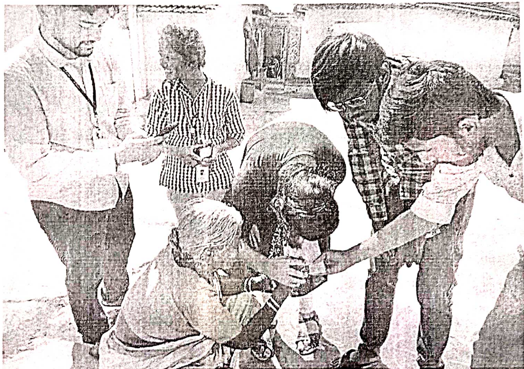
Fig. Students participated in special camp

Global Institute of Engineering and Technology – NSS cell has organized “Swachh Sarvekshan” on 23 rd March 2018 at Surangal village. 69 NSS volunteers and 6 committee members have participated in the camp. Awareness given to the village people about Health and hygiene, precautions during the camp.