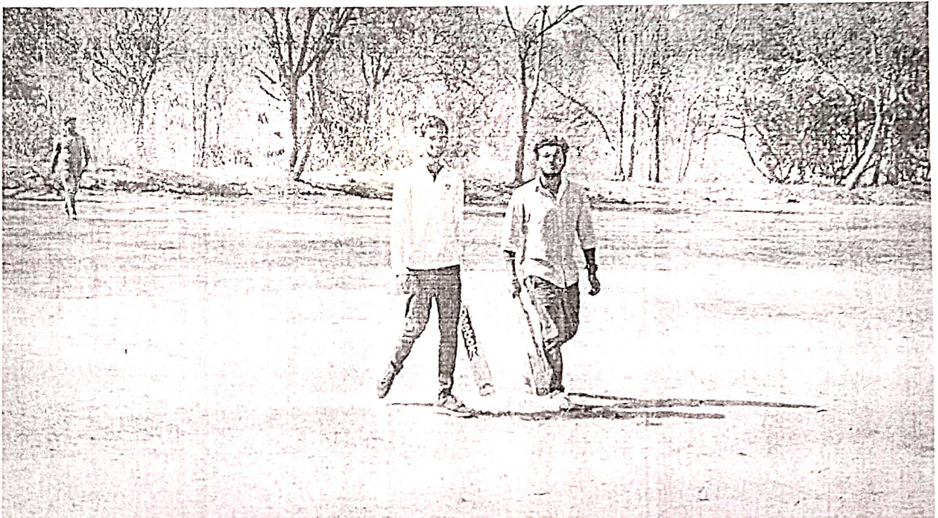
Fig. Students participated in special camp

Global Institute of Engineering and Technology – NSS cell has organized “Skill Development program” on 24 th March 2018 at Surangal village. 66 NSS volunteers and 6 committee members have participated in the camp. Various competitions were conducted to the village people and school students during the camp.