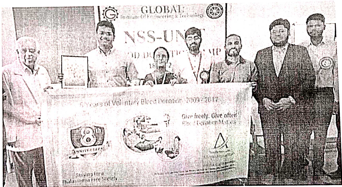
Fig. Student participants at blood donation camp