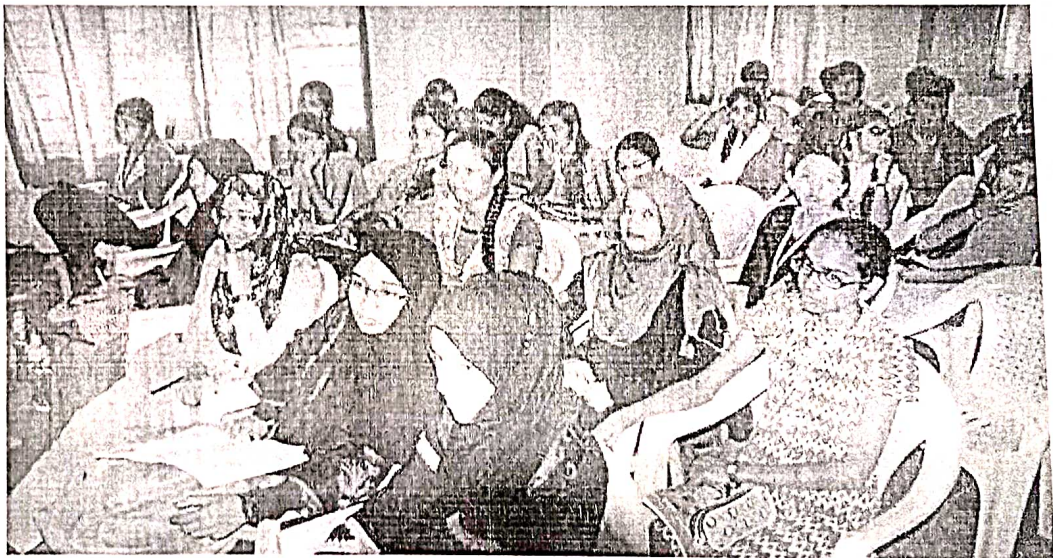
Fig. International Woman’s Day event held in GIET campus

NSS Cell of Global Institute of Engineering and Technology has organized “International Women’s Day” on 8 th March 2018. The event was a grand success with the support of student volunteers, authorities and management. 58 NSS volunteers and 6 committee members were actively participated in this event.