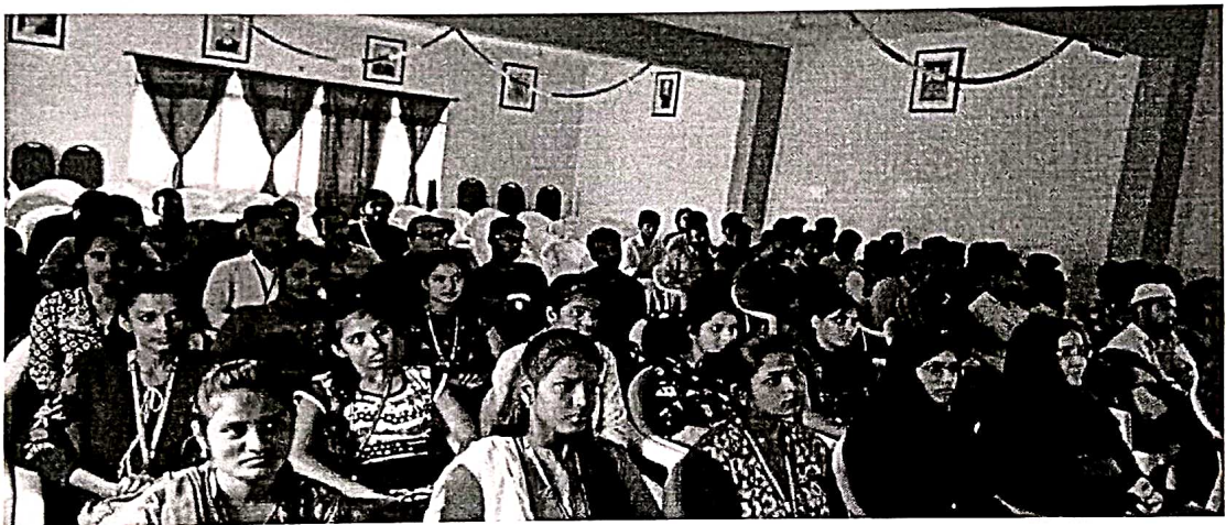
Students and committee members attending a one day talk on “Impotance of helmets”